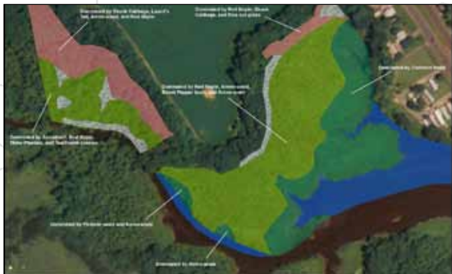
Presentations to regulators, policymakers, and the public