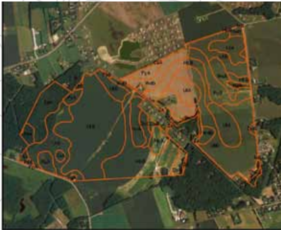
Screening for wetlands, soils, floodplains, topography, forest, and land use

Landmark Science & Engineering’s GIS, CADD, engineering and environmental staff is supported by state-of-the-art computer and software facilities, including high-end workstations and wide-format, color plotters and wide-bed scanner, that support ESRI ArcGIS 10 v.10 software. The GIS staff is experienced in accessing a wealth of data available at Federal, State and County levels for effective site analysis.