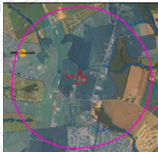
High-quality displays for major presentations